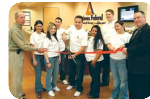
Members of the Chamber of Commerce and employees of the Laveen In-Store branch celebrated their grand opening with a ribbon-cutting ceremony on February 10.

Not going to be near your usual branch? Visit ArizonaFederal.org to find a different Arizona Federal branch, a surcharge-free ATM or shared branch location anywhere in Arizona and the rest of the country!